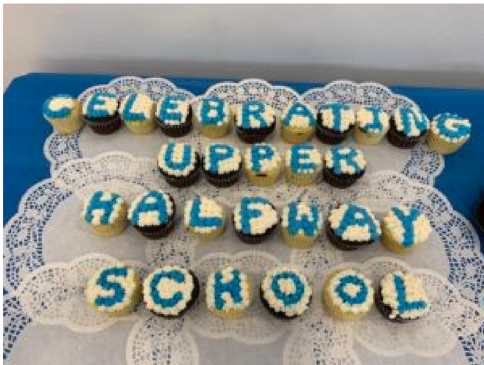
Gym Grand Opening - Monday, October 7, 2024