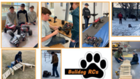
Bulldog RC Club meet after school twice a week learning skills, building structures and playing with their creations!