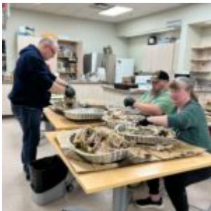
... carving up the turkeys

Annually NPSS staff organizes and serves up a turkey lunch for the students and invited guests, which turned out to be about six hundred (600) attendees this year.