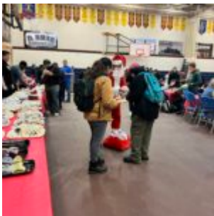
... Santa visited