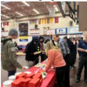
... serving up the lunch