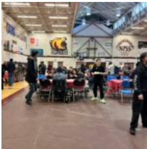
... enjoying lunch