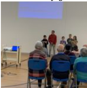
Student presentation about their school