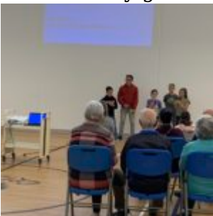
Student presentation about their school