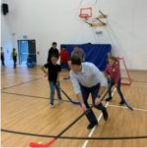
Floor hockey game with students & adults