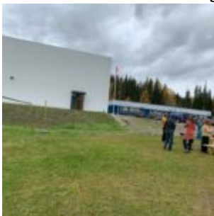
Exterior view of gym & school