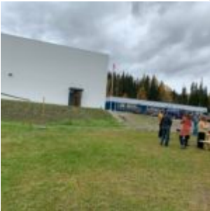
Exterior view of gym & school