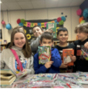
Read & Feed Prize Winners