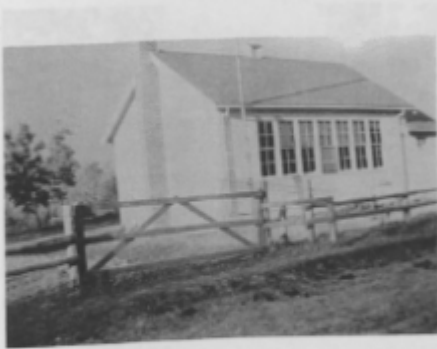
Baldonnel Primary School Building, Baldonnel, 1942