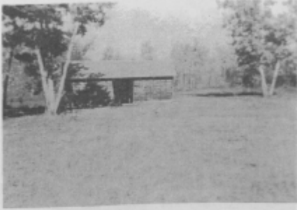
Baldonnel, School Barn and play area, Baldonnel, 1942