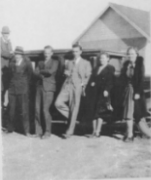
Teachers ready to travel to First Normal School Convention, Fort St. John School, 1940