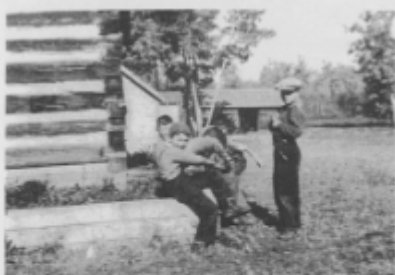
Baldonnel School boys, Peace River 1942