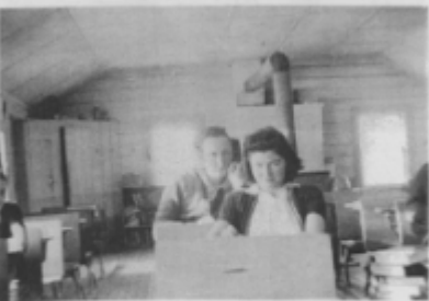
Inside Baldonnel classroom, Peace River, 1942