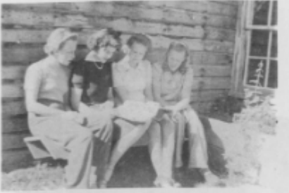
High School girls, Baldonnel School, Peace River, 1942