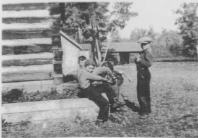
Kaldonnel School boys, Peace River 1942