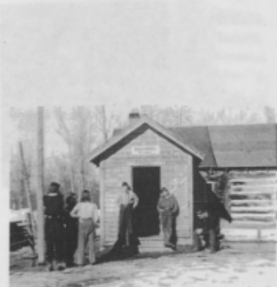
Baldonnel School, Peace River, 1942