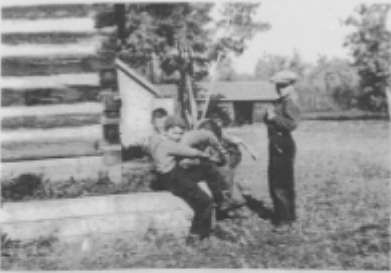
Baldonnel School boys, Peace River 1942