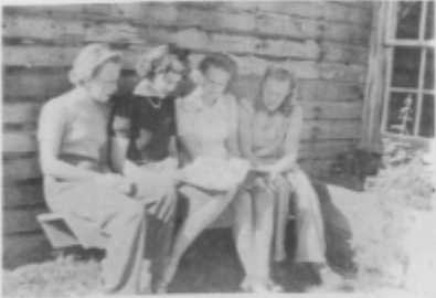
High School girls, Baldonnel School, Peace River, 1942