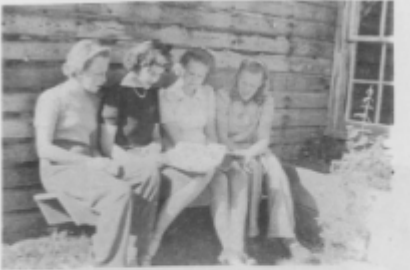
High School girls, Baldonnel School, Peace River, 1942