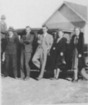
Teachers ready to travel to First Normal School Convention, Fort St. John School, 1940