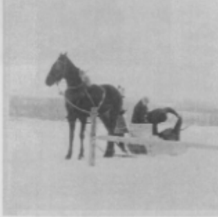
Typical homemade wooden sleigh used in winter by students teachers and the community, Peace River, 1941