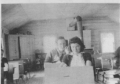
Inside Baldonnel classroom, Peace River, 1942