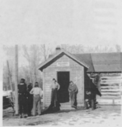
Baldonnel School, Peace River, 1942