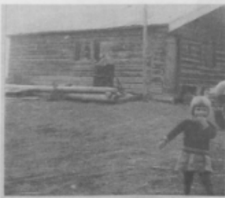
Linguist children standing in front of Boarding House owned by Linguist family, Peace River, 1940