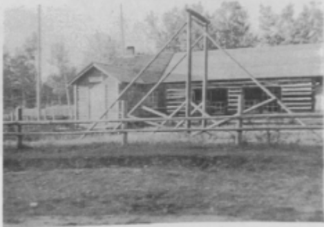
Baldonnel School, swings and playground, Baldonnel, 1942