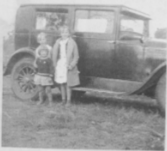
Linguist Children standing in front of Teachers car, Peace River, 1940