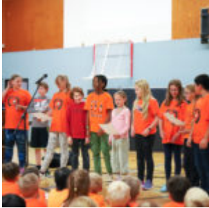
Presentation by students