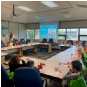
Discussing topics ...