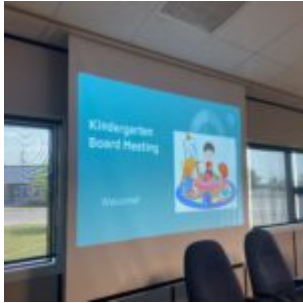
Starting the meeting ...