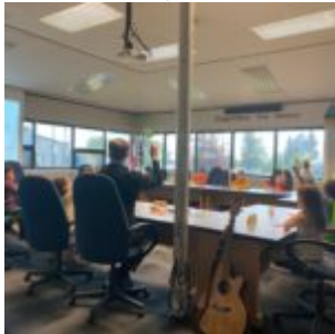
Voting on a motion ...