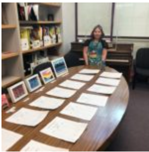
Artist ... *