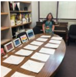
Artist ... *