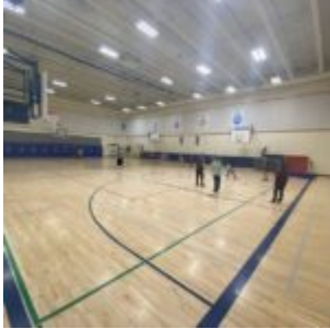
Craig Brownlee, Principal, Clearview Elementary Secondary