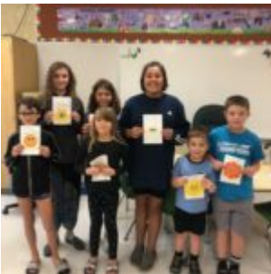
Bert Ambrose students made cards for the Hudson's Hope students

Examples like this played out across the region.