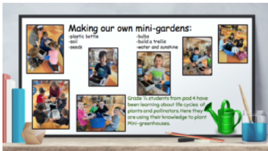
MMMCS Mini Garden