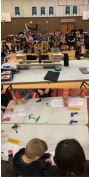
Griff Peet, Principal, Duncan Cran Elementary