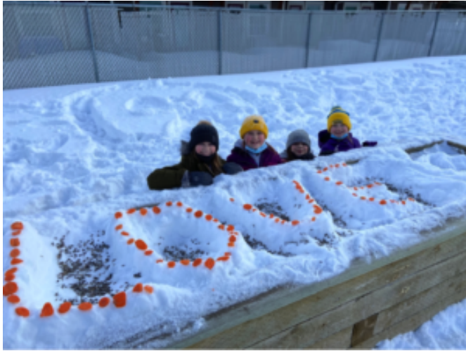
Lynne Côté-Aubin, Principal, École Central Elementary