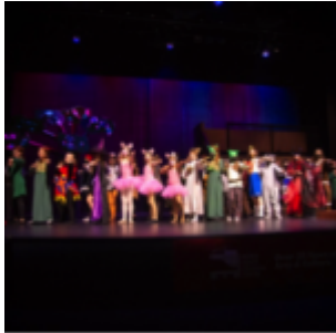
Shrek Musical Cast