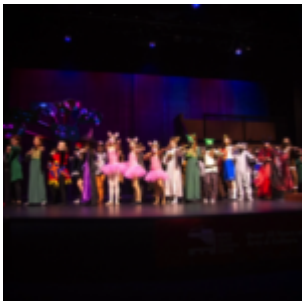
Shrek Musical Cast