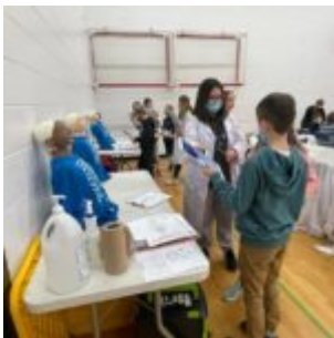
... how the body works