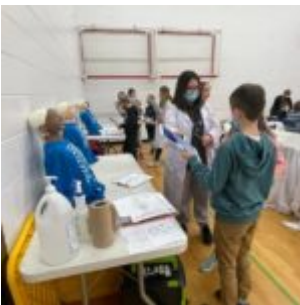
... how the body works