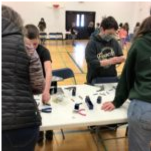
... making jewelry