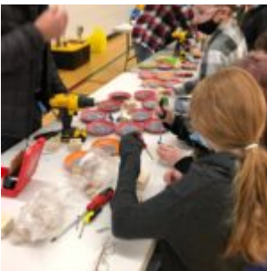
... creating block bots