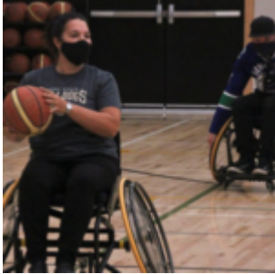
Wheelchair basketball game ...