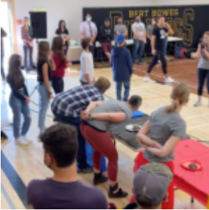
Teachers find gum balls in pudding pies