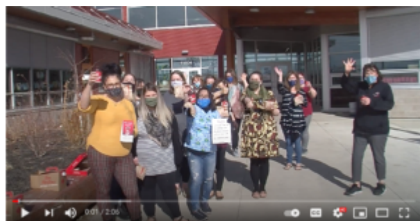
Fort St. John Tim Hortons owners on the road to thank frontline workers

Community Partnerships — Margaret 'Ma' Murray Community School got a visit from the Tim Horton's team as part of the company's desire to recognize frontline workers!