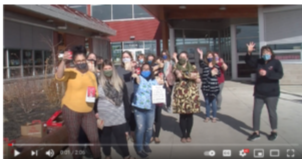
Fort St. John Tim Hortons owners on the road to thank frontline workers

Community Partnerships — Margaret 'Ma' Murray Community School got a visit from the Tim Horton's team as part of the company's desire to recognize frontline workers!