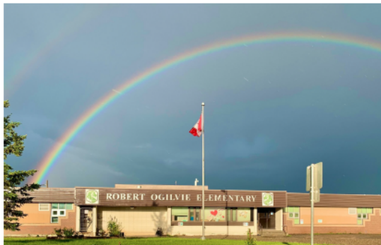
Robert Ogilvie Elementary - Framework for Enhancing Student Learning