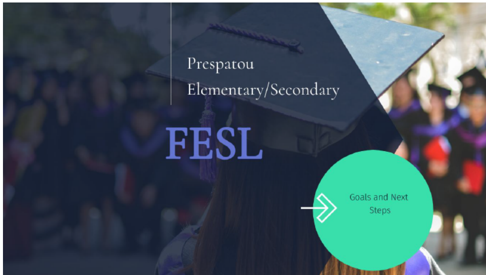
Prespatou Elem-Jr Secondary - Framework for Enhancing Student Learning