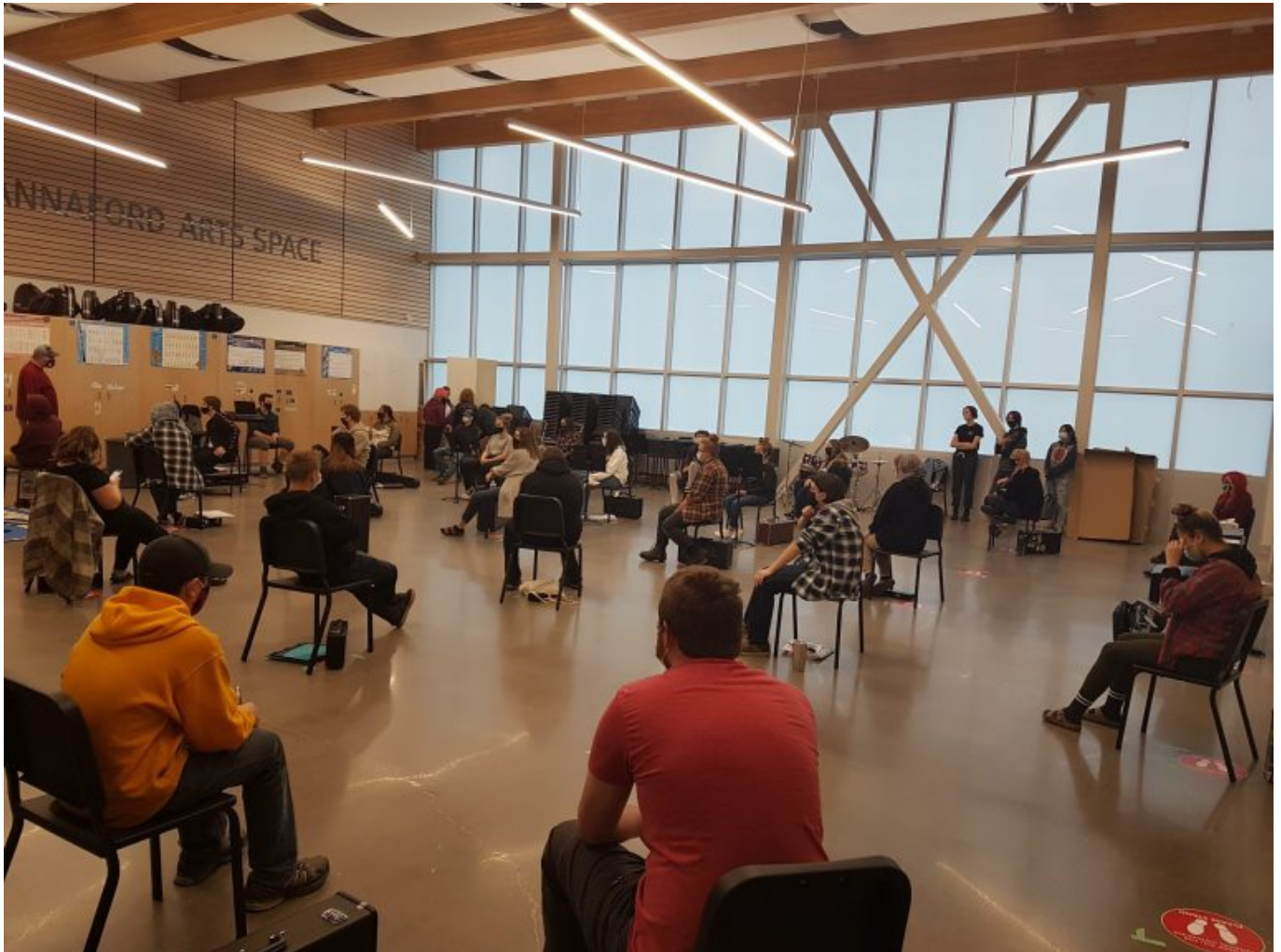
DISTRICT BAND - Biggest turnout for Senior Band in 20'ish years! 39 so far and more coming!