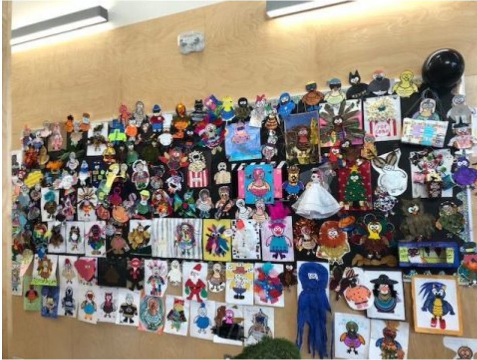
MONTHLY PARENTING SEMINARS - offered by School District No. 60 staff: