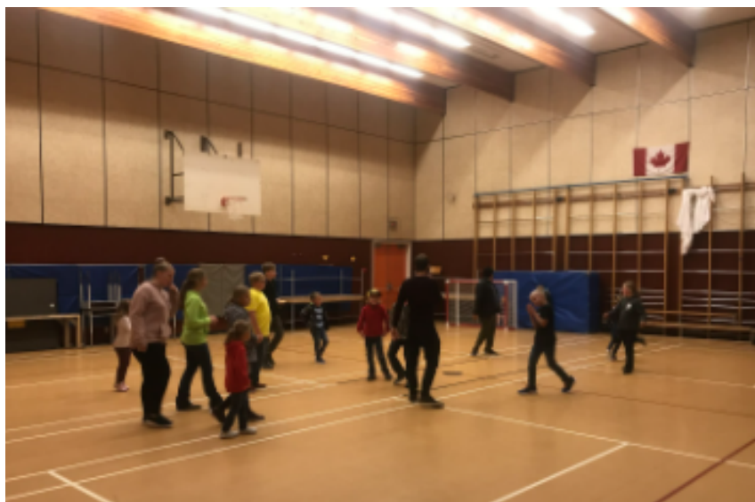
Buick Creek students in their gymnasium.

Buick Creek School - We are excited to see the new learning model at Buick Creek School up and running. Teachers from the Key Learning Center travel out to the community four days a week to provide instruction and support to 22 students ranging in grades from K-9. Along with EA support, a weekly StrongStart and administration oversight from the KEY, the community school has a full complement of educational services.