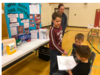
Student presenter and audience

Curriculum With Technology (CWT): Please click on the link here to view student examples and short movie clips. The program has evolved to support not only improved quantity and quality of writing but also many other curriculum areas. It is a 1:1 iPad program for grade 6 students across the district and has been instrumental in implementing the Universal Design For Learning framework.